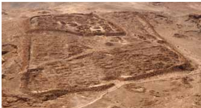
ILLUSTRATOR PHOTO/ GB HOWELL (35/54/38)

Right: Encampment for the Roman army at the foot of Masada.