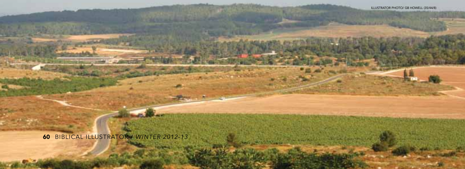
ILLUSTRATOR PHOTO/ GB HOWELL (35/44/8)