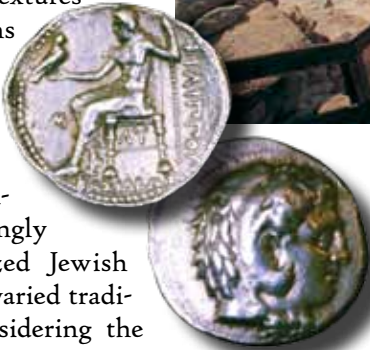
Left: Coin of Antiochus IV Epiphanes dated 175-164 B.C.; obverse-bust of Zeus Cassius, looks right, wears laurel crown with